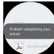
Fig.2. The iBeezi® app is not yet fully synced.