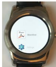
Fig.1. The iBeezi® icone is now appearing as an app on your smartwatch