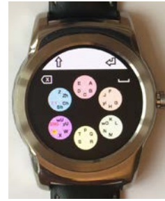
Fig.13. iBeezi® keyboard is appearing, you are ready to start inputting text