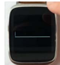
Fig.5. After starting the app, you will reach to the input line