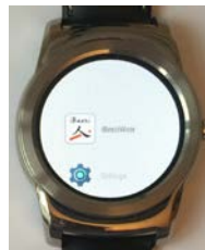
Fig.4. The iBeezi® icon is now appearing as an app on your smartwatch