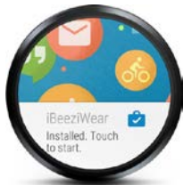
Fig.3. When completely installed iBeezi®, if activated, you will receive a notification